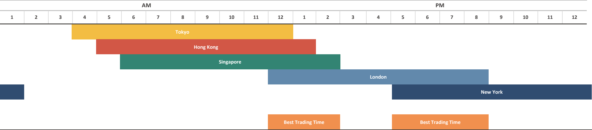
Forex Market Hours

Note: This chart shows the normal forex trading times of all the major forex trading centers across the globe in Pakistan Standard Time.